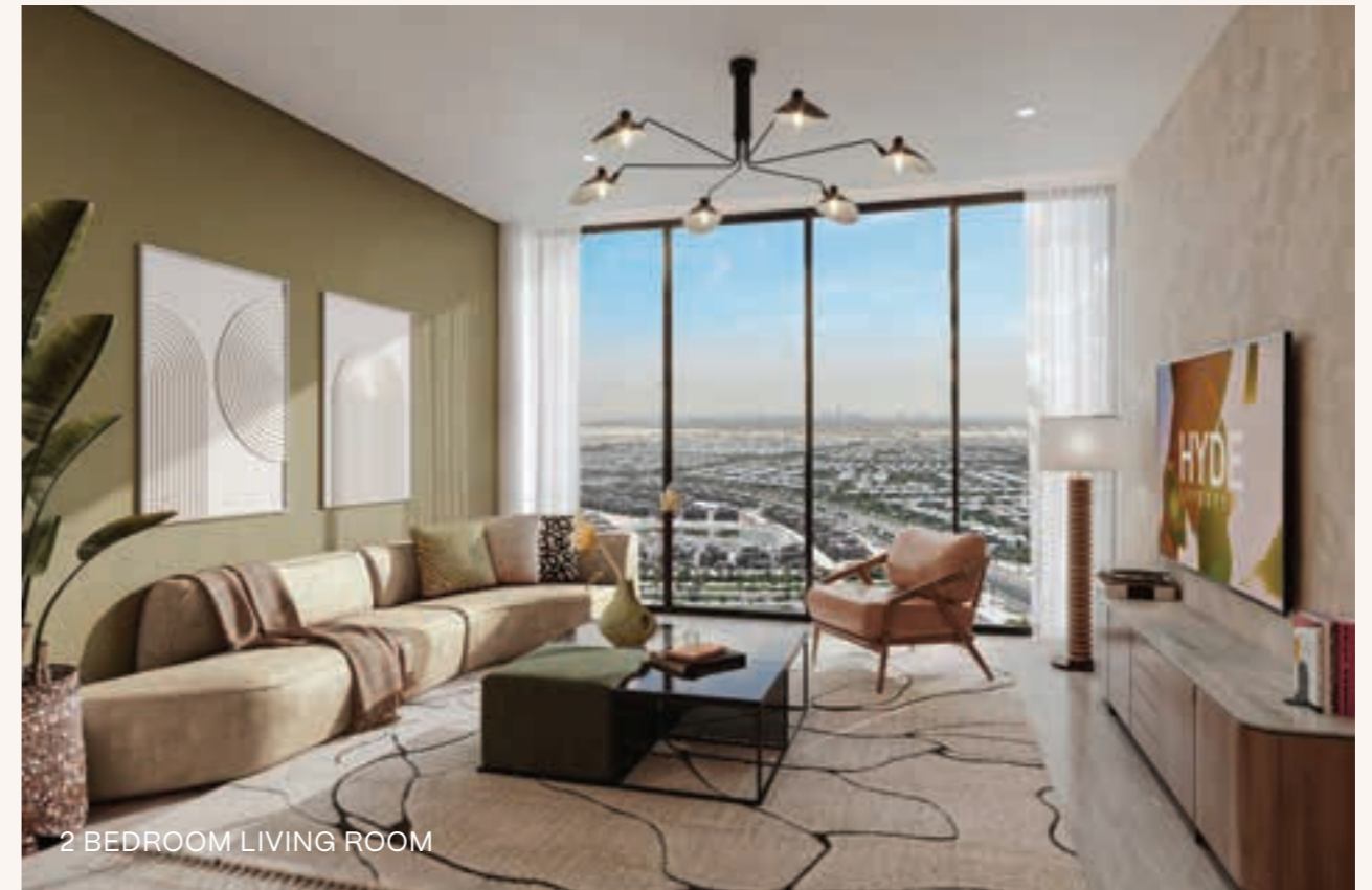
2 BEDROOM LIVING ROOM