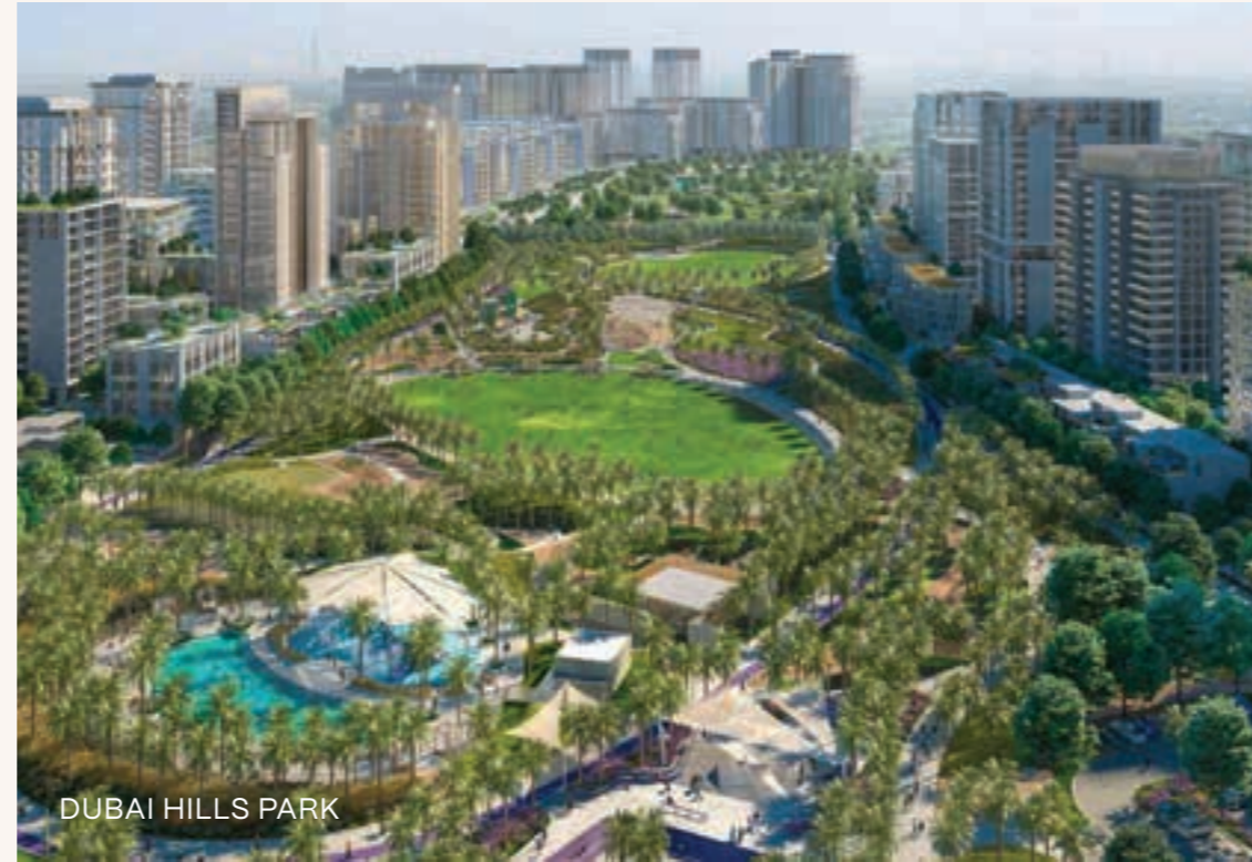
DUBAI HILLS PARK