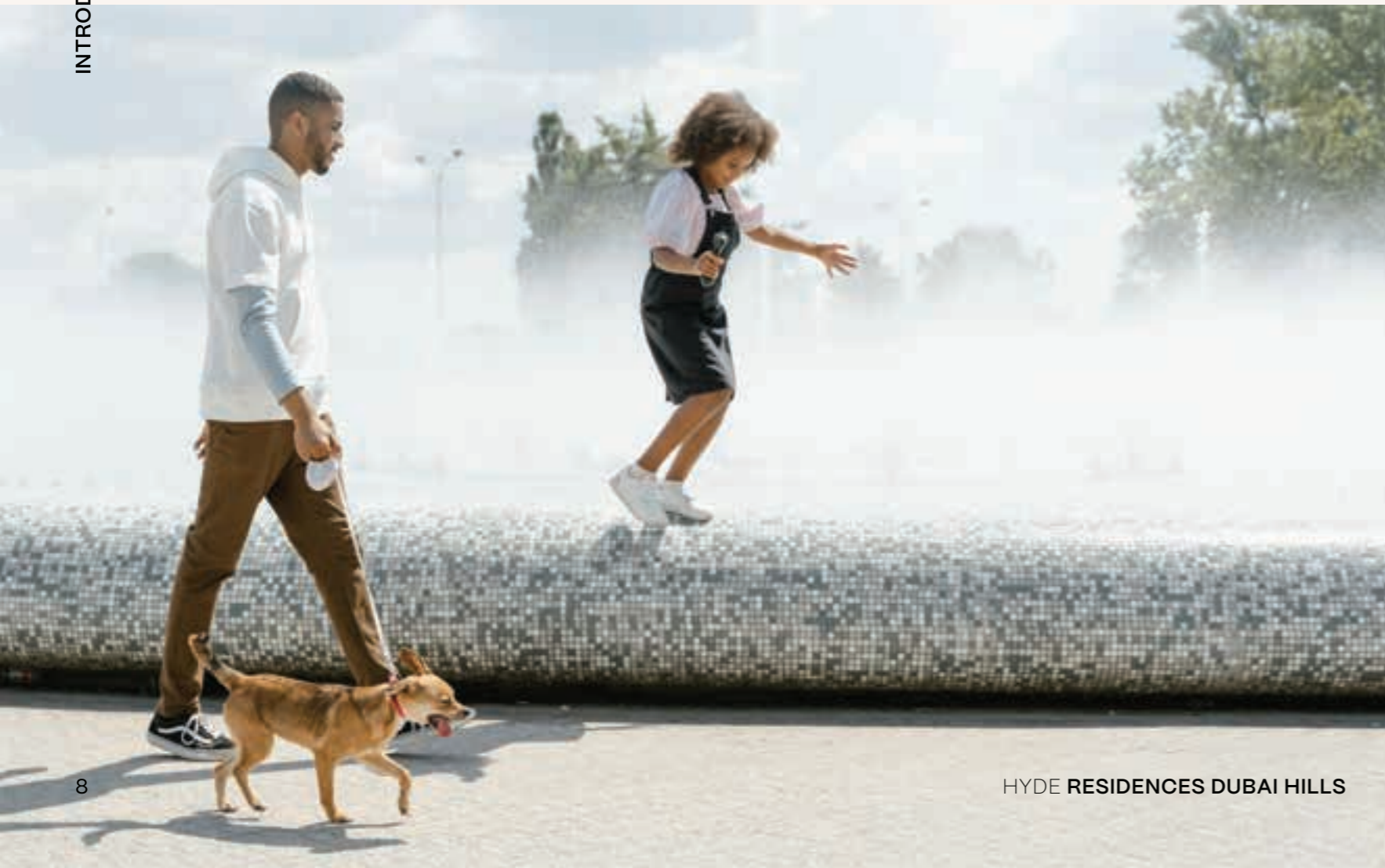
HYDE RESIDENCES DUBAI HILLS