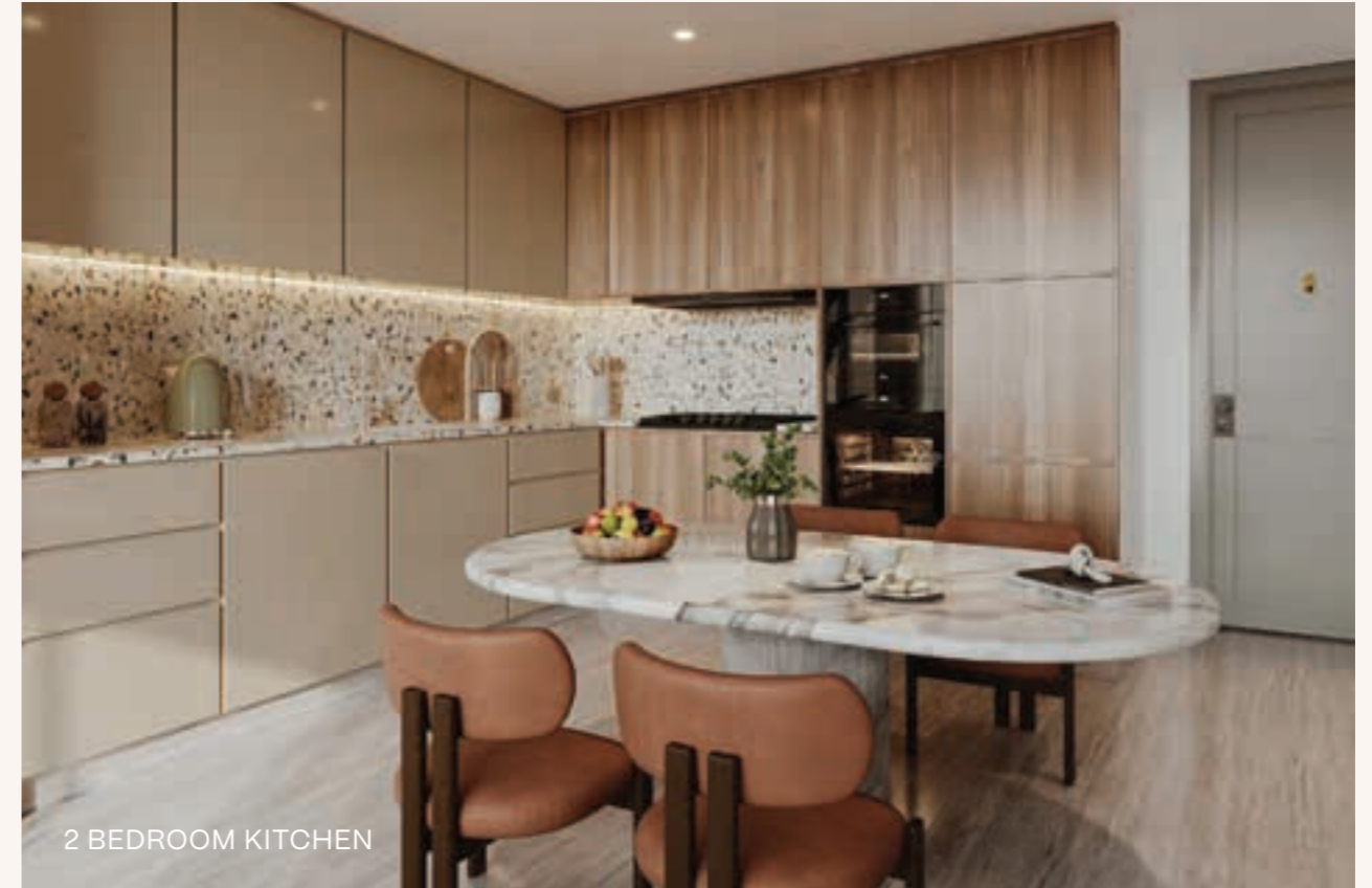
2 BEDROOM KITCHEN