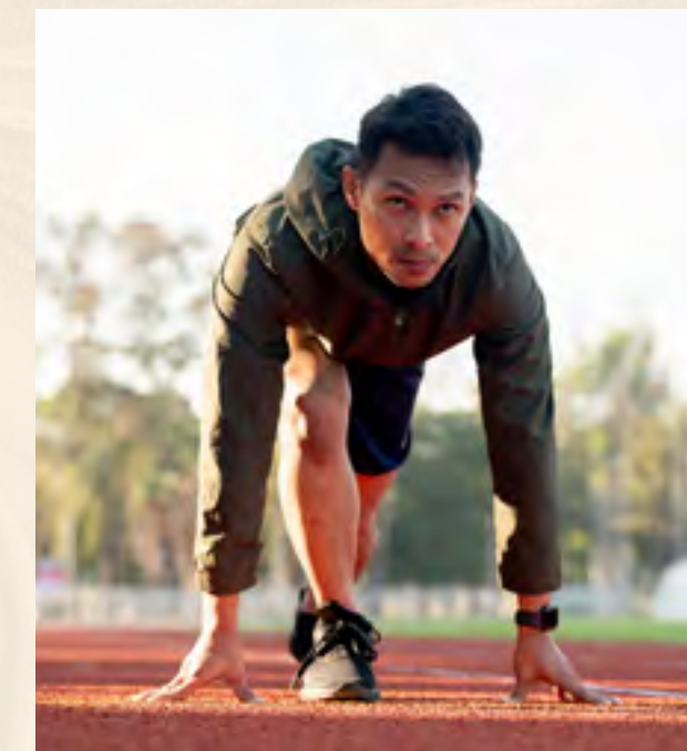
Running & Cycling Tracks