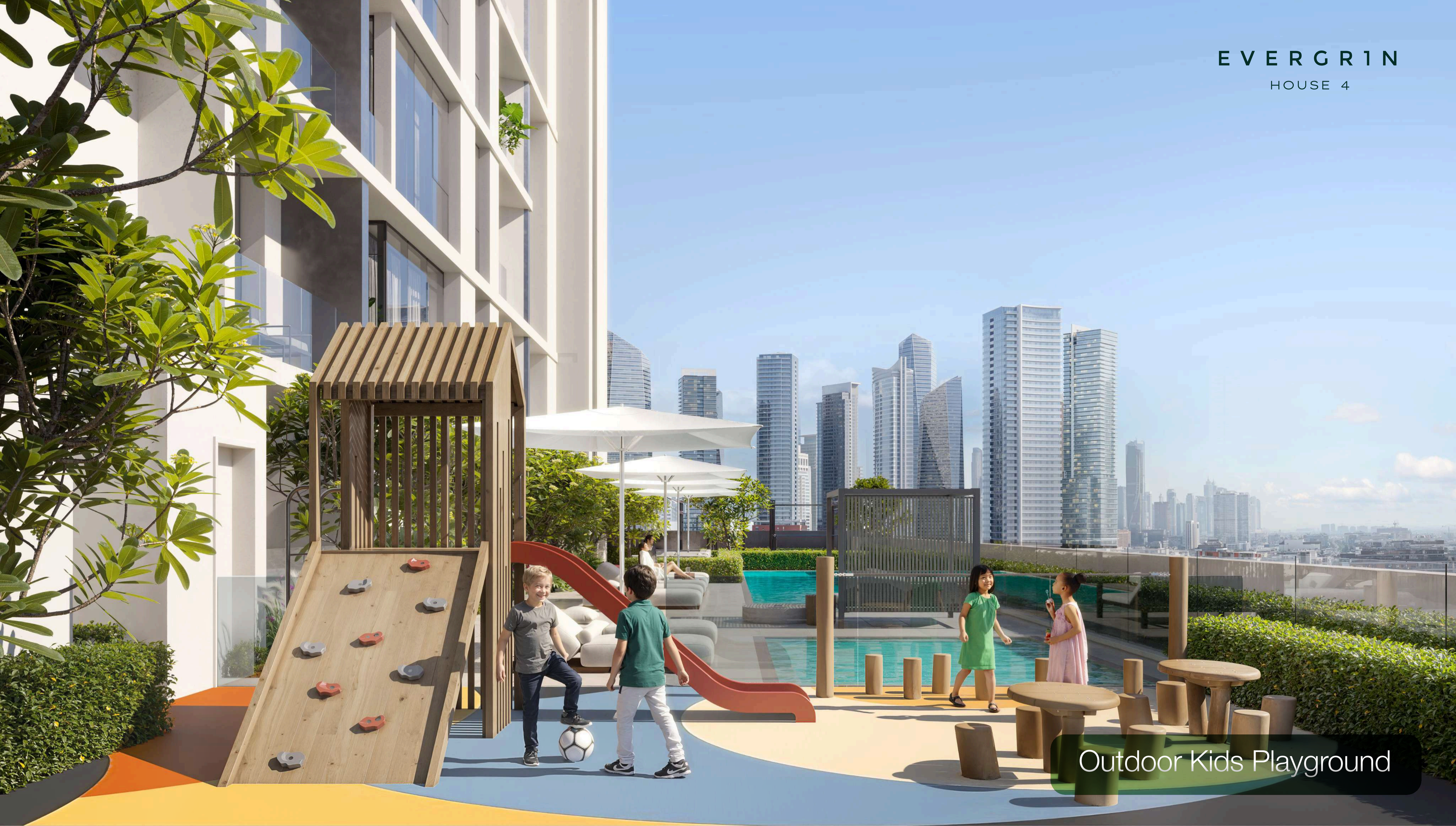
Outdoor Kids Playground