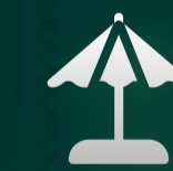
LA MER BEACH