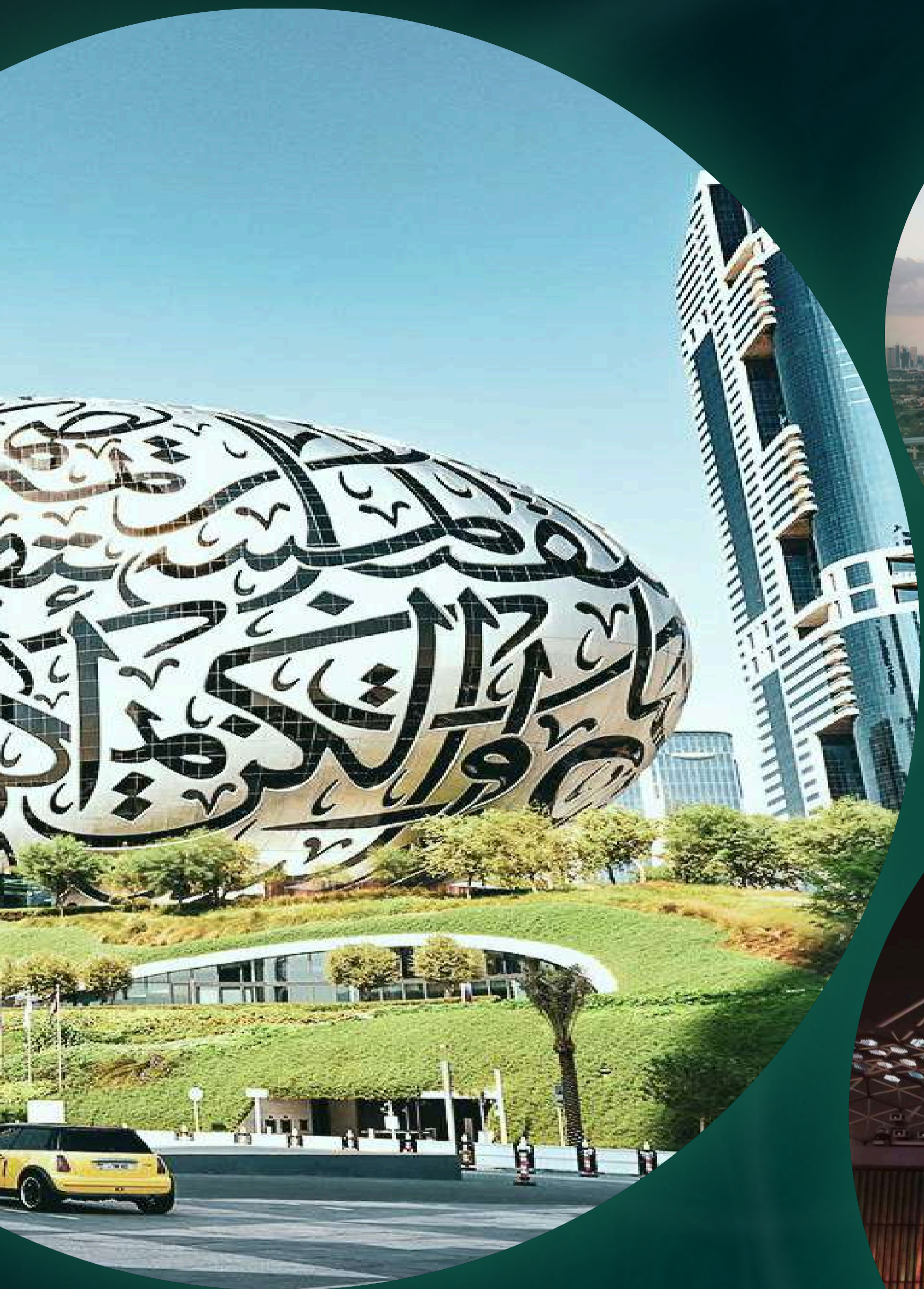
MUSEUM OF THE FUTURE